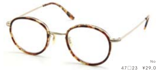
No.65 47□23 ¥29,000-

An authentic combination frame made of celluloid and titanium. The HF-118 has a titanium bridge attaching the celluloid front rims, while the HF-119 has a celluloid front wrapped around the titanium rims. Both designs are a classic Boston type glasses.