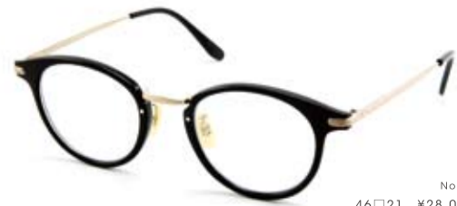
No.1S 46□21 ¥28,000-