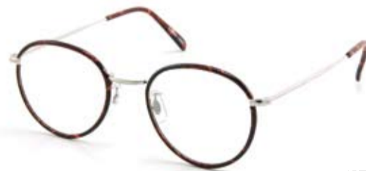
dark demi 47□19